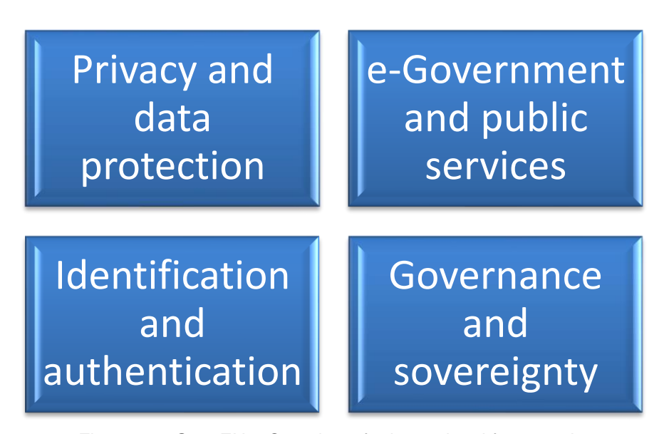
Figure 2: mGov4EU - Overview of relevant legal frameworks

The main characteristics and objectives of the mGov4EU infrastructure have been summarily described above. Based on those elements, four legal areas will be examined in detail in this deliverable (see Fehler! Verweisquelle konnte nicht gefunden werden. ):